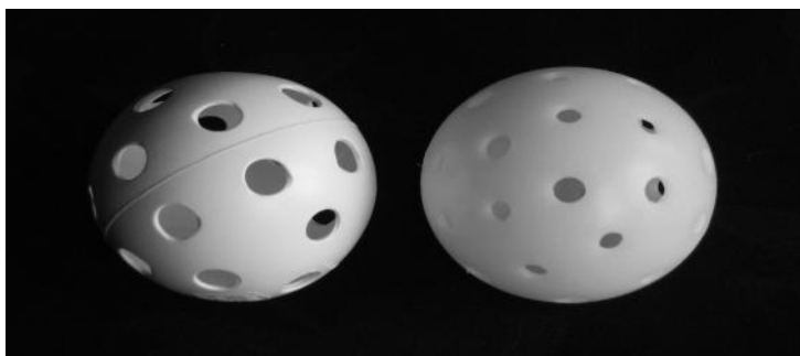
Figure 2-2. The Ball.

The ball pictured on the left of Figure 2-2 is customarily used for indoor play and the ball pictured on the right is customarily used for outdoor play. However, all approved balls are acceptable for indoor or outdoor play. The complete list of approved balls is on the IFP website.